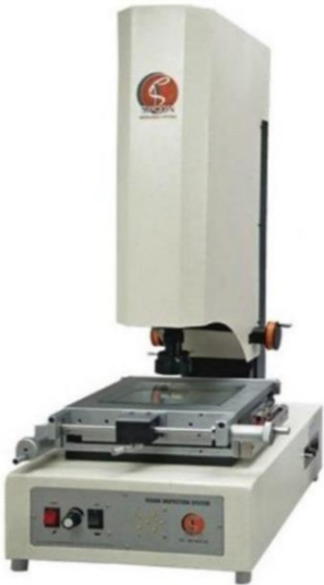
Vision Measuring System