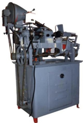
Special Purpose Machine