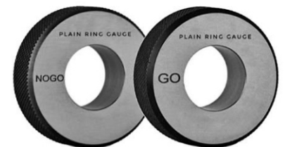
Plain Ring Gauges (Go - No Go)