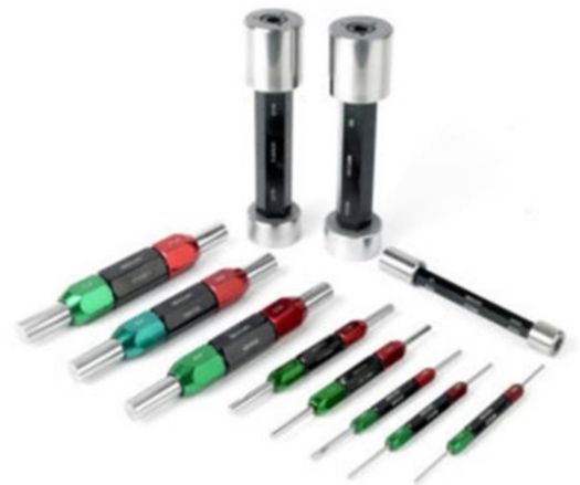
Plain Plug Gauges (Go - No Go)