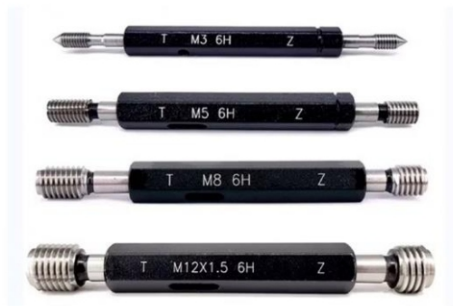
Thread Plug Gauges (Go - No Go)