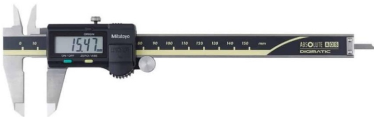
Digital Caliper Vernier