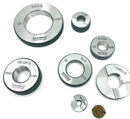
Thread Ring Gauges (Go - No Go)