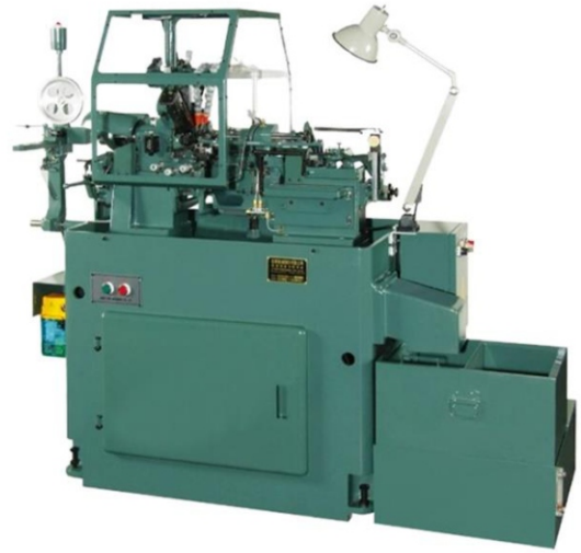
Cam Operated Machine