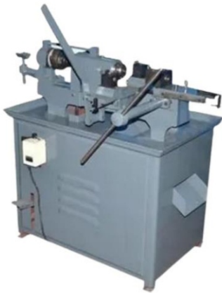
Semi Automatic Turning Machine